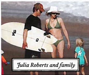
Julia Roberts and family