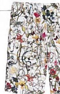
From left: Hermès beach towel ($550); Warm body oil ($50); Eugenia Kim headband ($150); Brooks Brothers flask ($78); Gucci swim shorts ($750).