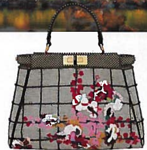
From top: Fendi bag ($5,780); Ralph Lauren Blue Label bikini top ($50) and bottom ($50).