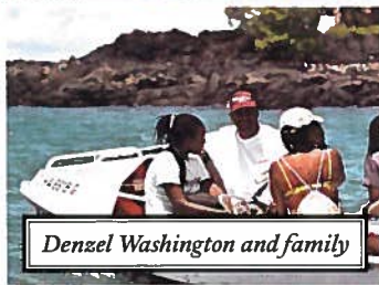
Denzel Washington and family

THE MIX IS ECLECTIC AND USUALLY INCLUDES ASSORTED NATIVE HAWAIIANS—THEMSELVES A DIVERSE BUNCH—AS WELL AS HIPPIES, TECHIES, GOLFERS, SURFERS, NORTH AMERICAN AND ASIAN TOURISTS, FARMERS, AND THE OCCASIONAL FUTURE PRESIDENT. THE BIG ISLAND IS ALSO A FAVORITE GET-AWAY FOR SILICON VALLEY AND HOLLYWOOD EXECS. PAUL ALLEN HAS A COMPOUND IN KONA, AND NEIGHBOR MICHAEL DELL OWNS THE LOCAL FOUR SEASONS FRANCHISE, WHICH IS FAVORED BY NANCY PELOSI, AMONG OTHERS. DENZEL WASHINGTON AND LEONARDO DICAPRIO HAVE VISITED RECENTLY, AS HAS JULIA ROBERTS, WHO IS RUMORED TO BE MOVING THERE SOON.